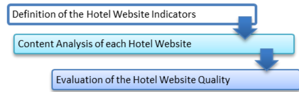
Figure 1 - Framework proposed for the characterisation and evaluation of hotel websites

The proposed framework was structured in three phases. The first, (a) comprised the definition of the indicators and dimensions of hotel websites (Akincilar & Dagdeviren, 2014; Diaz & Koutra, 2013). The second (b) consisted of the content analysis technique to evaluate the presence of indicators on the hotel's websites (Salavati & Hashim, 2015). Finally, the third (c) consisted of relevant techniques to measure, characterise, analyse and evaluate the hotel websites quality (Calero, Ruiz, & Piattini, 2005; Wang, Law, Guillet, Hung, & Fong, 2015) (see Fig. 1).