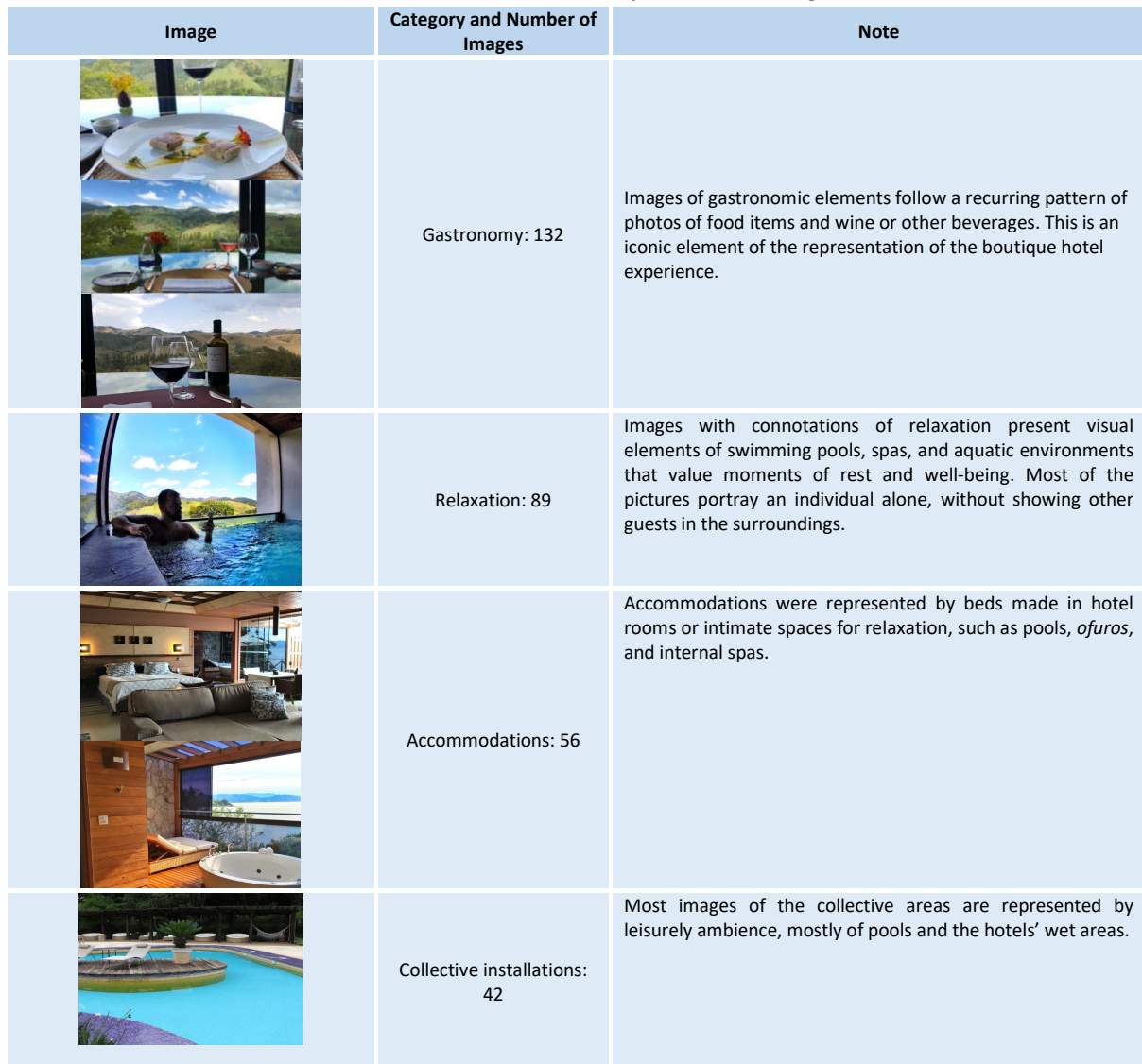
Table 6 - Travelers’ reviews on hotels: TripAdvisor and Instagram

After analyzing the images, it was possible to thematically group them for interpreting the process of the construction of sense and meaning of the creation of each image. The user-posted images were divided into the following five conceptual categories, according to the repetition and similarity in the process of symbolic constitution: gastronomy, relaxation, landscape, accommodations, and collective facilities (Table 6).