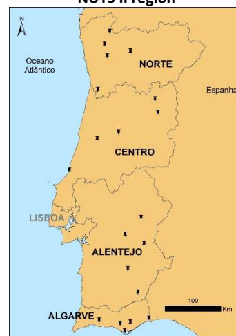
Figure 1 - Creative tourism pilot projects distribution by NUTS II region

One of the specific activities of the CREATOUR project is to put into operation 20 creative tourism pilot projects in small cities and rural areas of Portugal: 5 in the Norte region, 5 in the Centro region, 5 in the Alentejo region, and 5 in the Algarve region (NUTS II level).