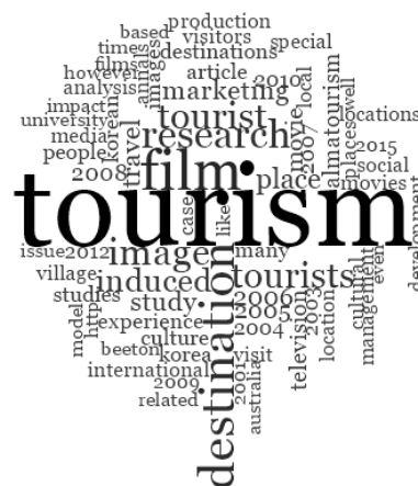
Figure 1 – Representation of the 100 words (with more than four letter) most quoted in the articles analysed

Proceeding with our exploratory analysis of the contents of the various studies under analysis, figure 1 displays the results of the representation of the 100 words with more than four letters mentioned in the articles.