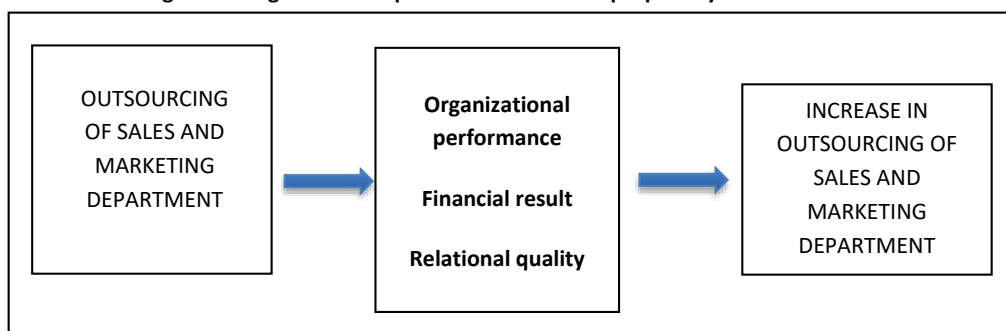
Figure 2 - Organizational performance and the propensity to outsource